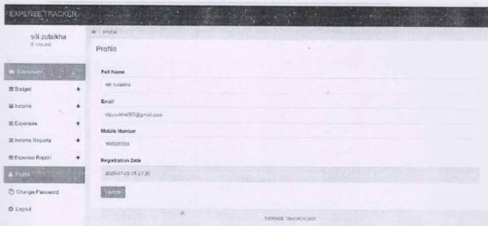
Figure 4.4 User profile page

Based on Figure 4.4, the page will display the user's information. In this page, user can edit or update their information they want to.